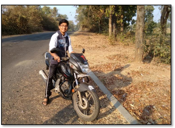
Fun on the roads of Gadchiroli