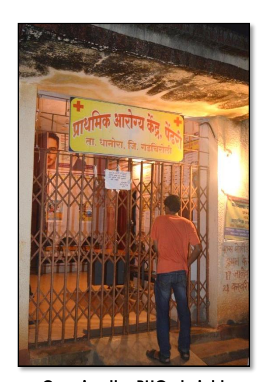
Opening the PHC at night