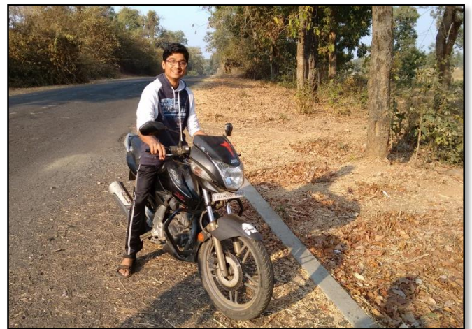
Fun on the roads of Gadchiroli