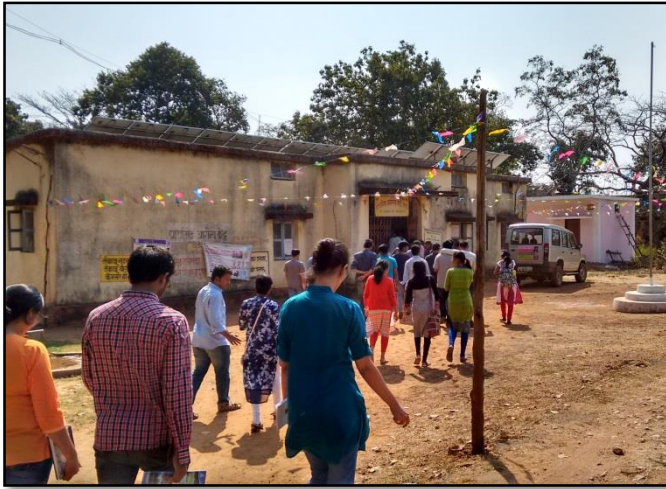
NIRMAN medical participants visiting PHC Pendhari